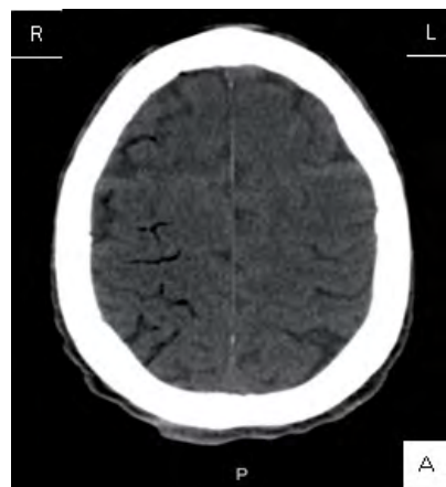
Figure 1. A: Cerebral CT with GE located in the cortical branches of the right middle cerebral artery. B: Cerebral MRI with small foci of acute ischemia at the pre-central, right frontal and right frontal gyri.

Conclusion: In this case, airflow occurred in the systemic venous system, resulting from TAB, which is a rare complication (0.02 to 0.06%) 2 , migrating to the arterial system through PFO, with embolization to the vasculature causing ischemia.