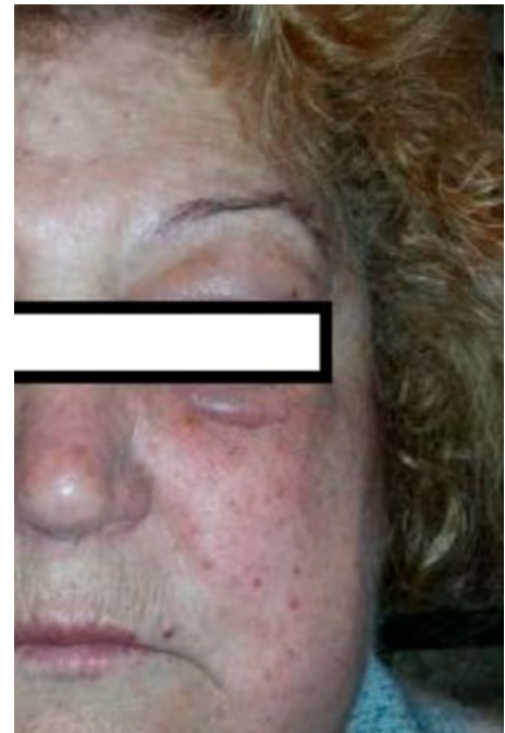
Figure 1. Patient with facial edema

Recibido: 21/06/2016; Aceptado: 23/09/16