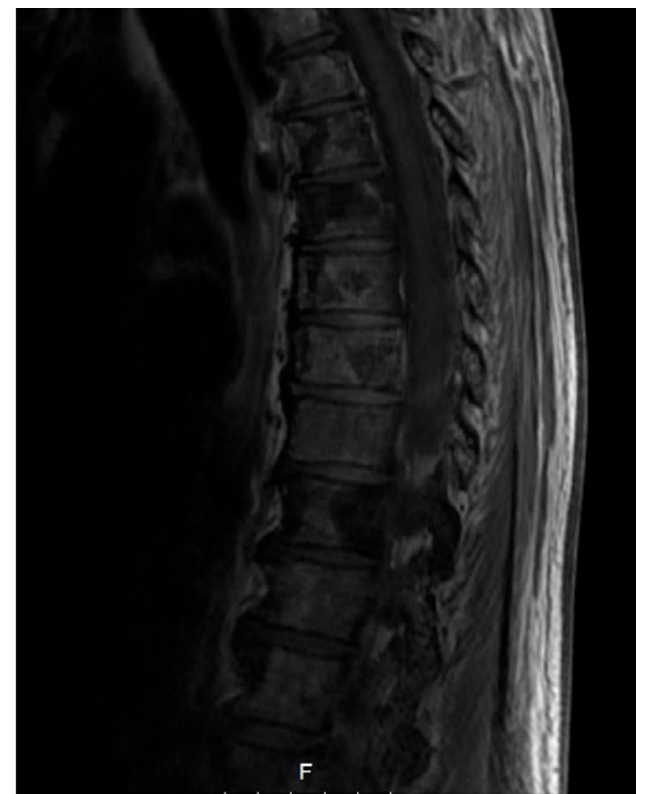
Figure 2. Spinal MRI showing bone metastasis and signs of a soft tissue mass causing cord compression in L3, L4 and cauda equine.

Our patient was diagnosed with metastasis after 9 months after ressection of the primary tumour and had an overall survival of 17 months post-diagnosis of metastasis which is inferior to the median repported in Li and co-workers, however the population was quite heterogeneous<sup>6</sup>. As the patient presented with both pleural and diffuse spinal metastasis the hematogenous dissemination was probably the cause, even though invasion of CSF can not be excluded.