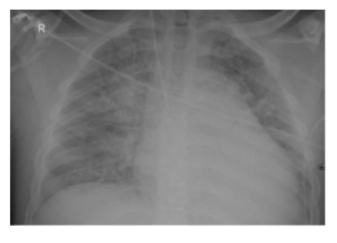
| 137 | Galicia Clin 2018; 79 (4): 137-138

Figure 1. Chest radiography at admission