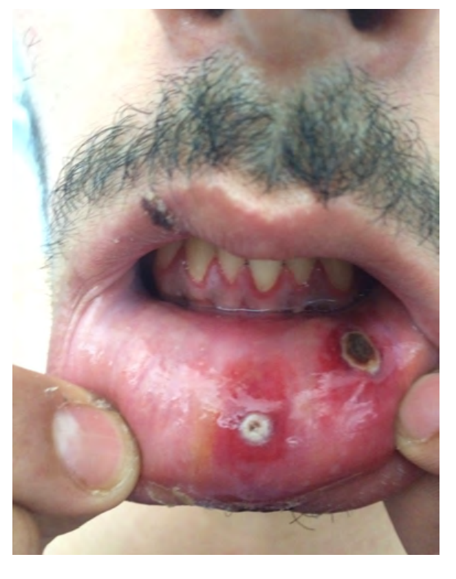
Figure 1. Mucosal ulceration and friable gingival mucosa.

a right non-tender, soft, about 3 cm long axis axillary adenopathy was palpable; heart and lungs sounds were normal; abdomen was tender and painless, with no palpable masses or organomegaly; no peripheral edema.