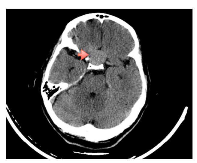
Figure 1 - CT scan showing round hypodense image above sellar space (red arrow) suggestive of pituitary macroadenoma.